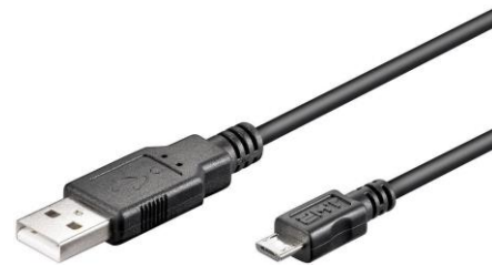
USB - Micro USB Cable